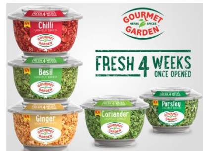
Lightly dried herbs and spices