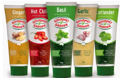
Stir-in pastes and seasonings