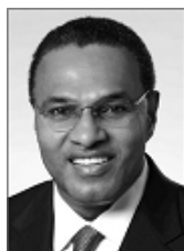
Freeman A. Hrabowski, III